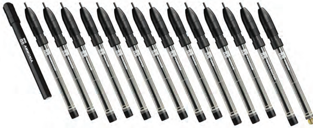
TruLine Family of ISEs

* EPA approved sensors for wastewater and/or drinking water compliance reporting.