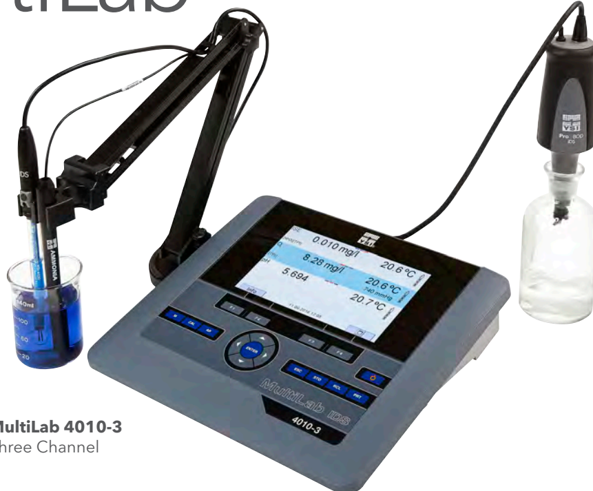
MultiLab 4010-3 Three Channel