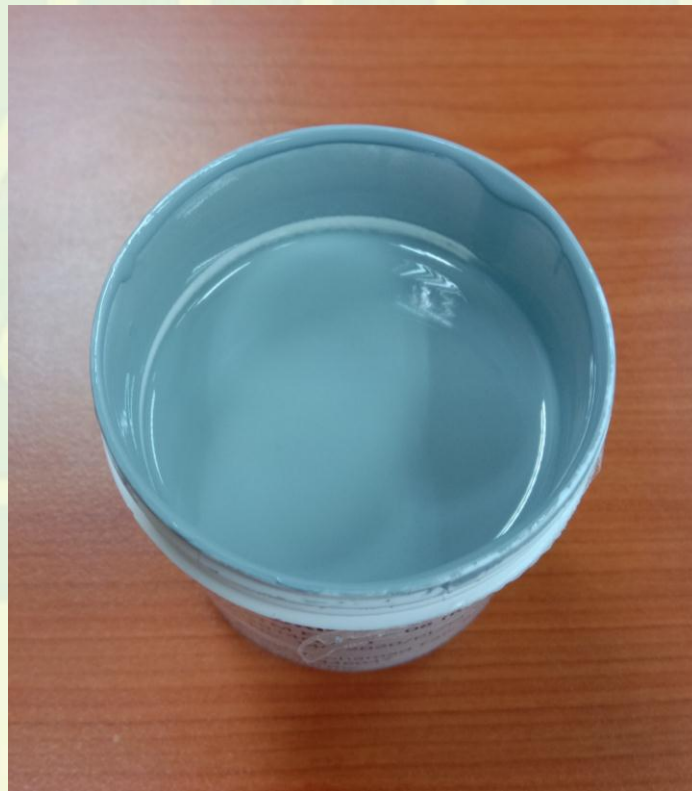
Figure 1. Photograph of 'DRI-GARD CF 900; Brand: DRITECH' Sample