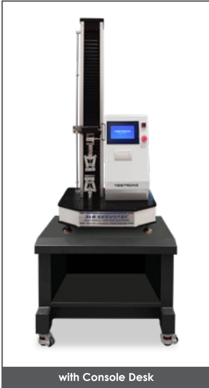
with Console Desk