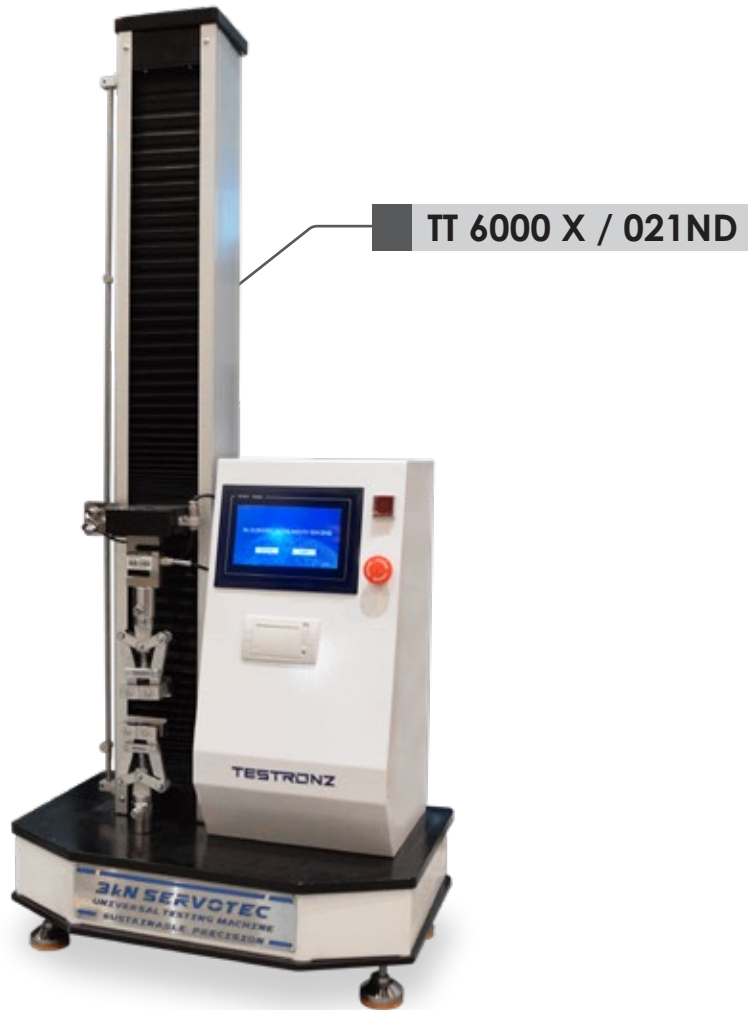
TT 6000 X / 021ND