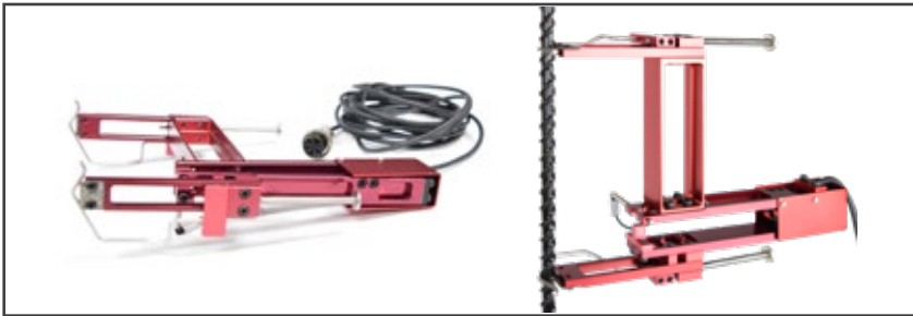
Axial Electronic Extensometer