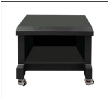
Console Desk T1