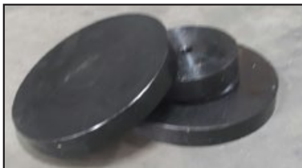
Compression Plated Set