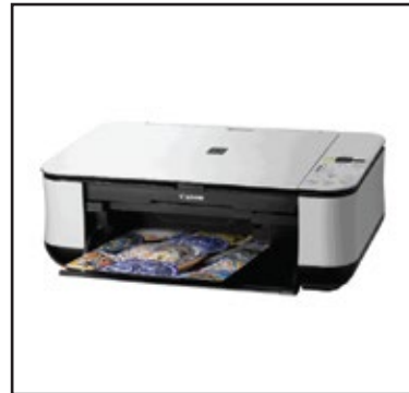
TT CP - 200