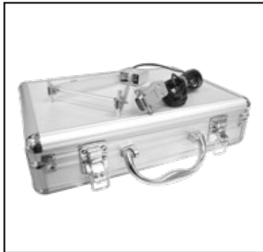
TT YYU - 25/100