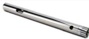
DS-500/2 Cat No.18201332

Solid and liquid dispersion Volume 10–5000mL Max. circum. Speed 22.7m/sec General purpose Emulsion granularity range 1–10µm Suspension granularity range 10–50µm