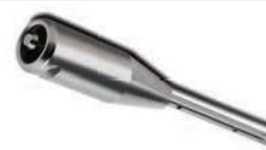
DS-500/5 Cat No.18900117

Emulsion Volume 10–5000mL Max. circum. Speed 22.7m/sec General emulsion purpose Emulsion granularity range 1–10µm Suspension granularity range 10–50µm