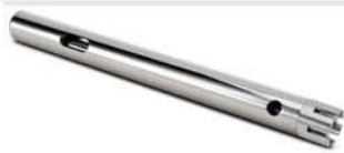
DS-500/1 Cat No.18201331

Solid and liquid dispersion Volume 10–5000mL Max. circum. Speed 22.7m/sec General purpose Emulsion granularity range 1–10µm Suspension granularity range 10–50µm