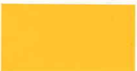
Bright Yellow 21073