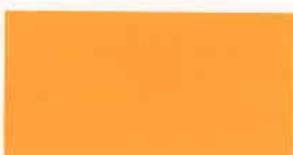
Golden Yellow 20453