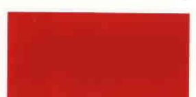
International Orange 20436

Also available in Black 21144 & White 21145