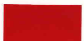
Bomba Red 50800