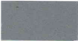
Silver Grey 6000

Metal-Lux MIO is an alkyd paint pigmented with micaceous iron oxide to enhance corrosion protection in comparison to colour pigmented gloss finish.