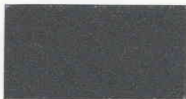
Dark Grey 6300