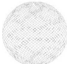
Orbitor 4 nozzle spray pattern