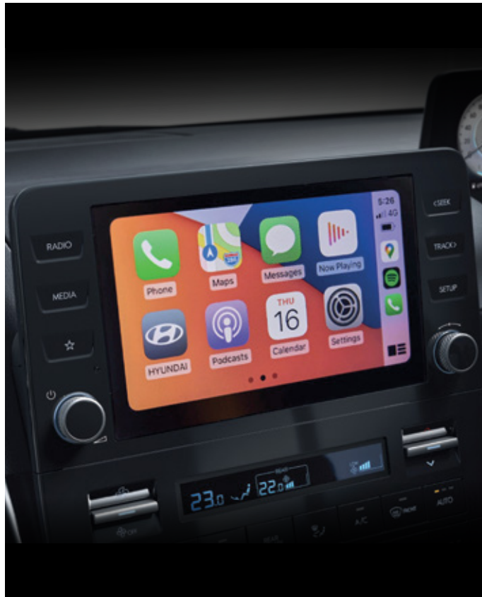
8" touchscreen display with wireless Apple CarPlay and Android Auto™

The exceptional versatile STARIA 10-seater will have you looking forward to the fun of the next road trip. The perfect choice for large families comes with loads of comforts and convenience features that magically shrink long distances and make time fly by.