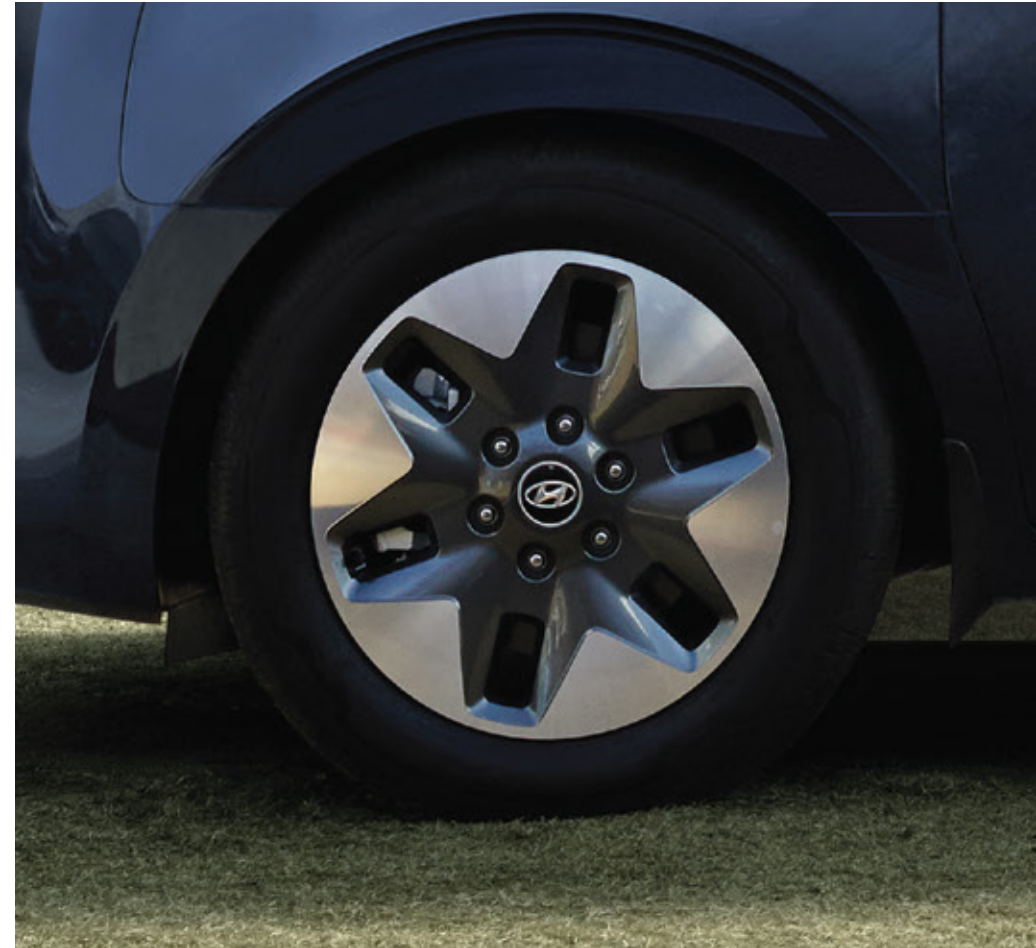
18" alloy wheels*