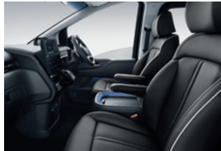
Black monotone interior (Nappa leather)