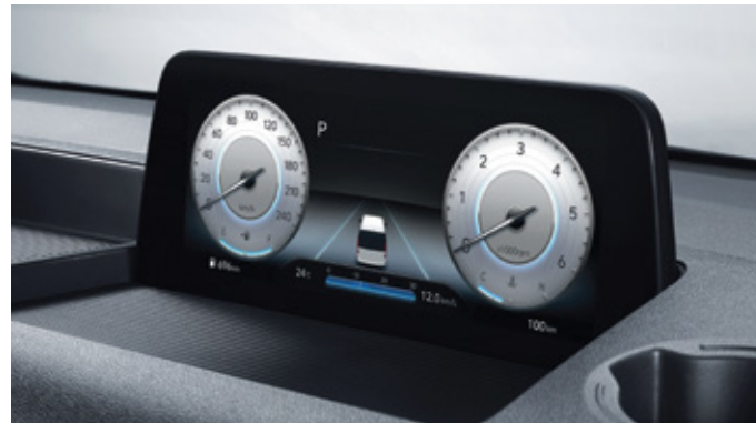
10.25" Supervision Cluster***