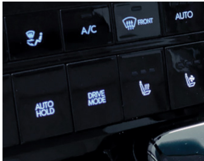
Drive Mode Select with 4 drive modes (Smart, Normal, Eco and Sport)