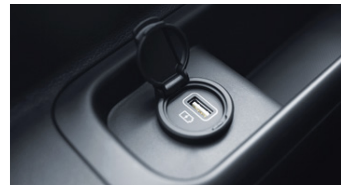
8 USB outlets available