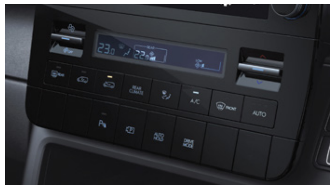
Full-auto air conditioning system*