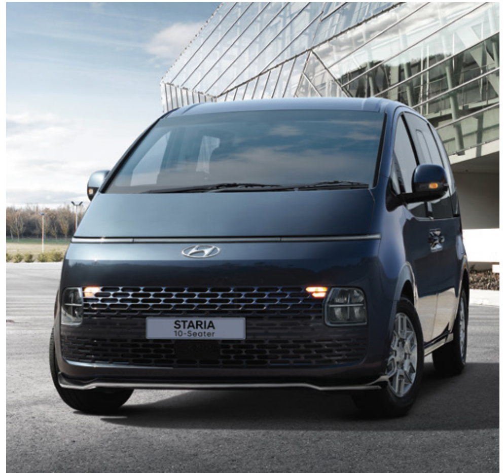
New exclusive body kit****