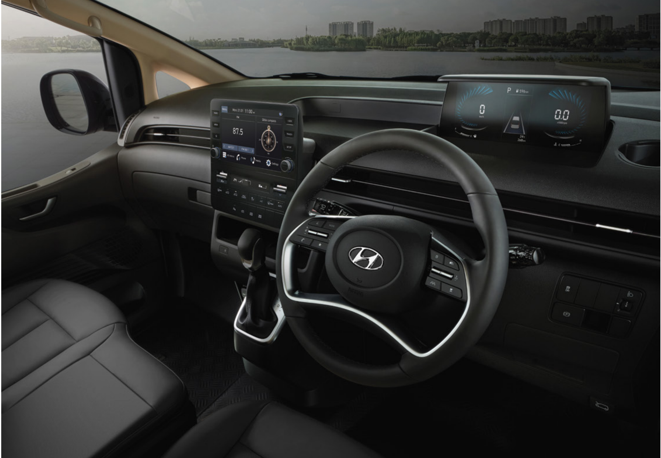
Pictures are for illustration purposes only. Actual units may differ. Terms & conditions apply.