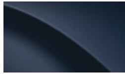
Moonlight blue pearl