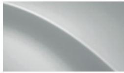
Shimmering silver metallic