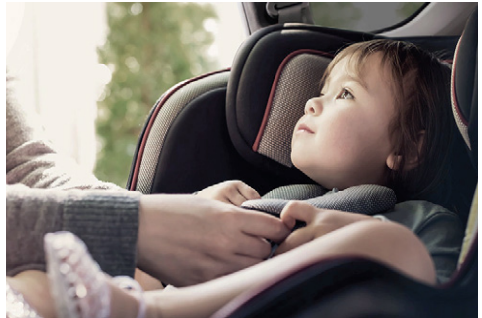
Rear Occupant Alert (ROA)