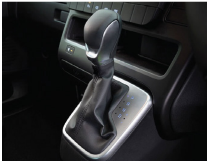
Leather wrapped gear knob