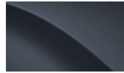
Graphite grey metallic