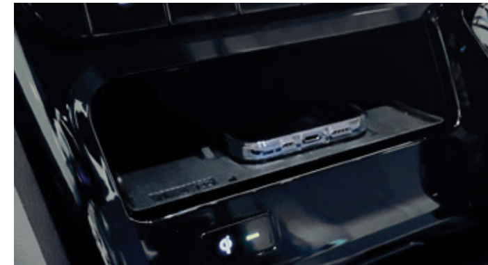
Wireless smartphone charging system*