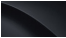
Abyss black pearl