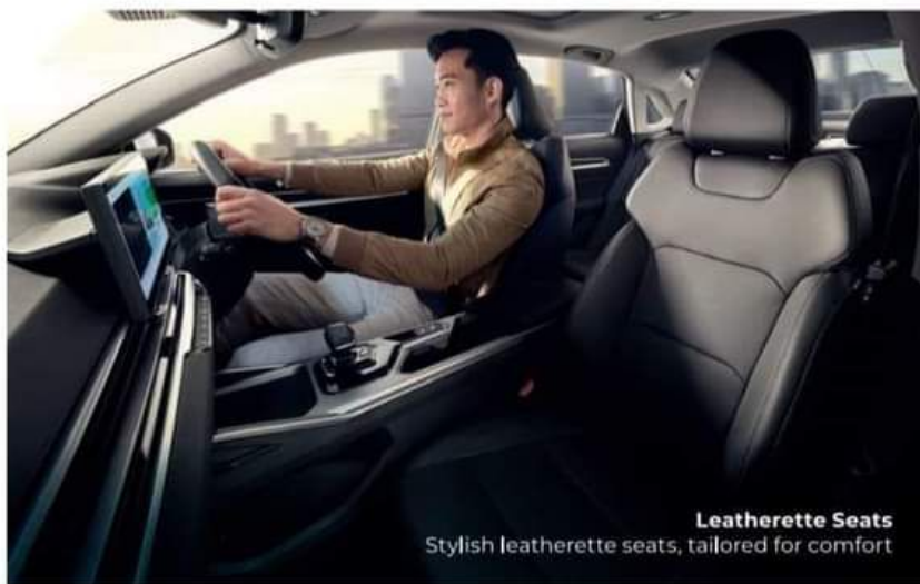
Leatherette Seats Stylish leatherette seats, tailored for comfort

From its striking design to its sophisticated details, the interior of the PROTON S70 is meticulously crafted to offer maximum comfort for you and your passengers, delivering an exceptional experience