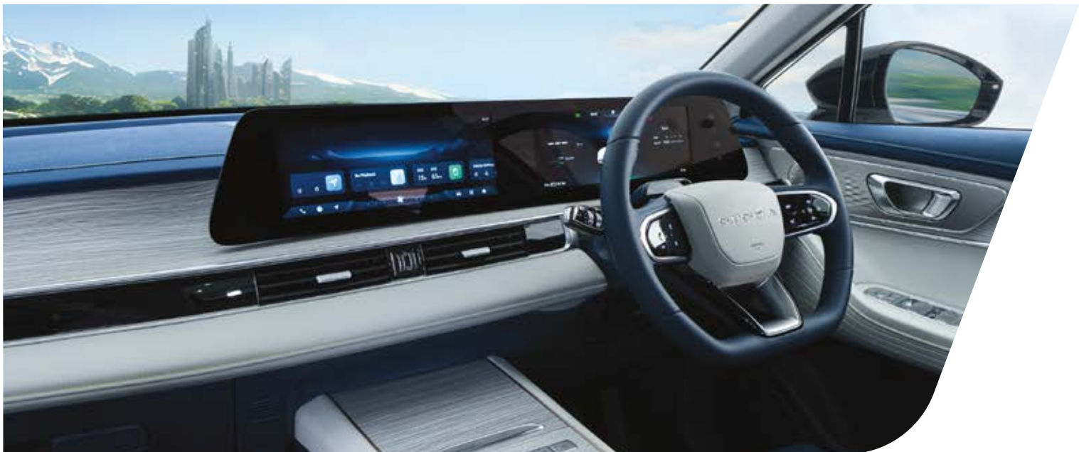
Futuristic Cabin with 24.6 inch Super Large Curved Screen