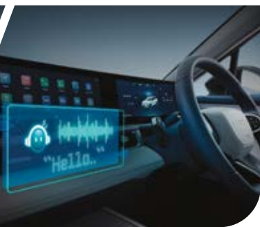
Intelligent Voice Assistant