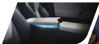
Front Armrest with Cooling System