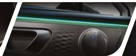
64 Multi-Colours Ambient Lights