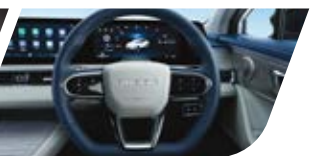
Multi-Fuction Steering Wheel