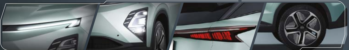
LED Daytime Running Lamp (DRL)