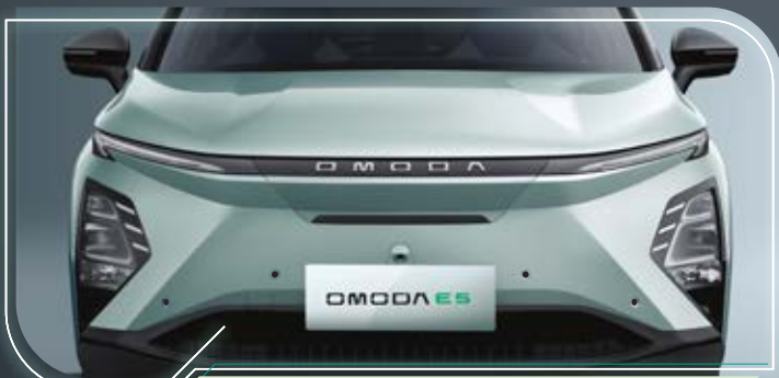
X Future Tech Front