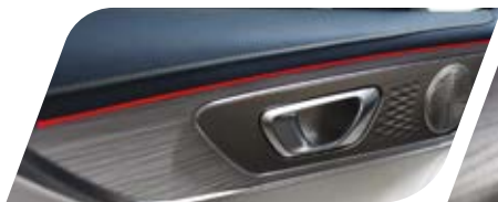
Multi-Colour Interior with Soft Touch Material