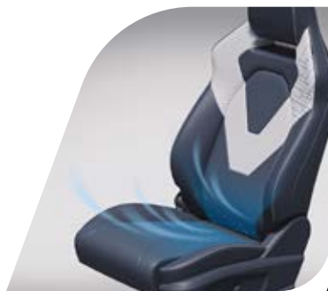
Driver & Passenger Ventilated Seat