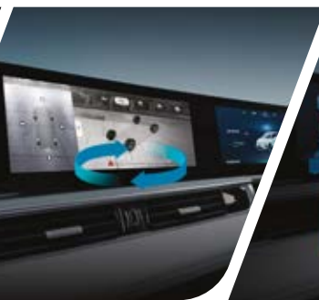
540° HD Panoramic Camera