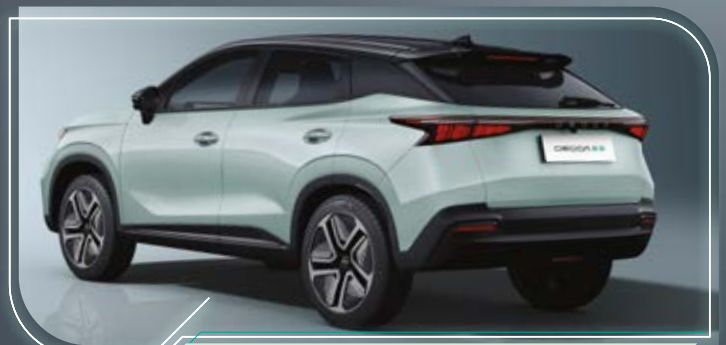
Light & Shadow Cutting Streamlined Body