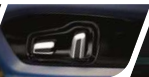
Driver and Passenger Electric Seat Adjuster