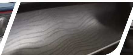
Special Wood Panel Dashboard