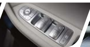
Power All Window