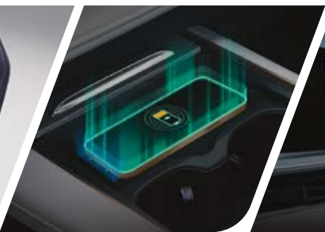
50w Wireless Charger with Cooling System