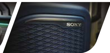
Sony B Speakers