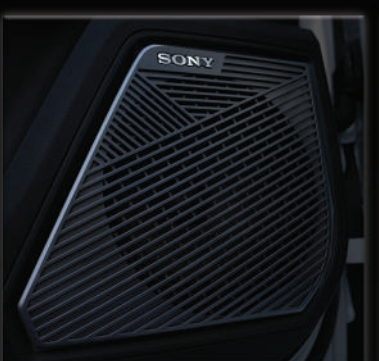
SONY Surround Sound System

A seamless blend of style and performance with the Avantgarde Fighter-inspired Transmission Shift.