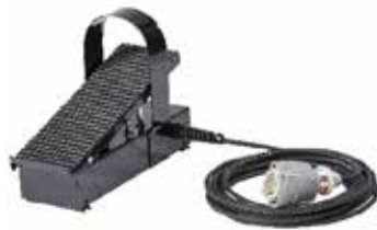
Foot controller RC-F ESC 260232