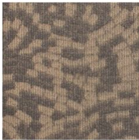
BX 04 Brown