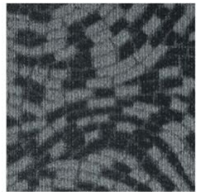
BX 01 Dark Grey