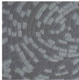
BX 03 Light Grey