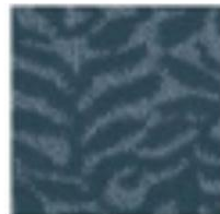
F1172 DENIM BLUE