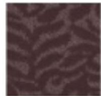
F1228 BROWN SOIL