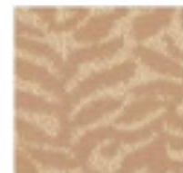
F1095 IVORY BEIGE