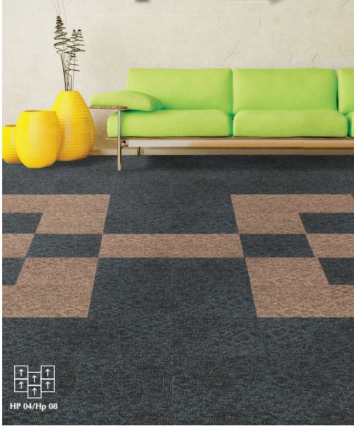
HP 04/HP 08