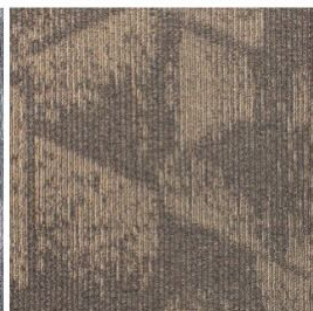
KN 04 Brown