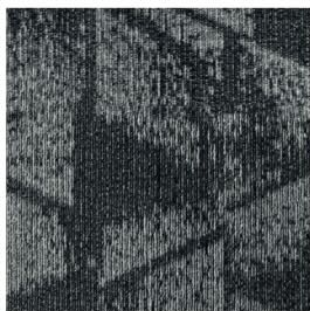
KN 01 Dark Grey