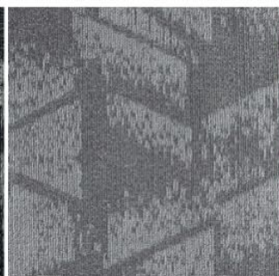
KN 03 Light Grey