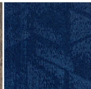
KN 05 Blue