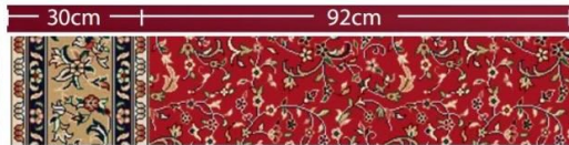
1903CR Chilli Red