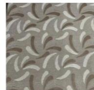
MD 01 BEIGE