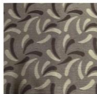
MD 03 BROWN