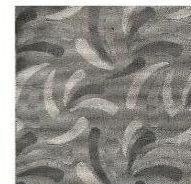
MD 04 GREY