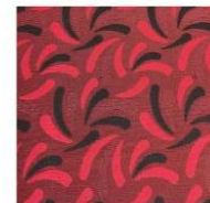
MD 02 RED