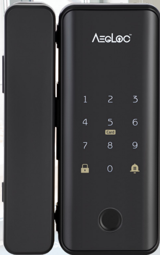
AEG-SDL-G10 Black Unit Price RM1299 (12 Sets/Cartron)