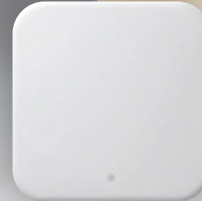
WiFi Gateway AEG-GW-E8560 List Price RM300