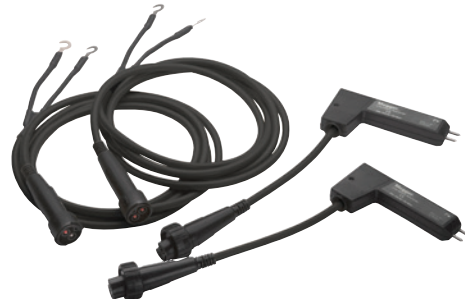
DH1-C 3M Duplex Handspike lead set, with connect (x2) Order part number: 1006-442