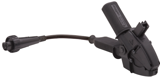
KC2-C Kelvin Clip 2 - connect (x1) Order part number: 1006-451