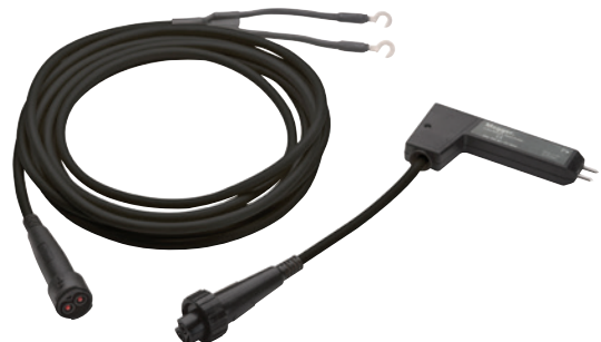
DH2-C 6m / 20' version of DH1-C above but only 1 included Order part number: 1006-443