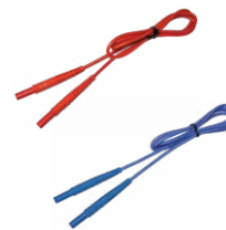
Test lead 1.2 m (banana plugs) red / blue