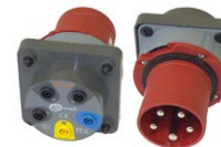
Three-phase socket adapter 63 A