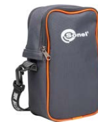
M13 carrying case