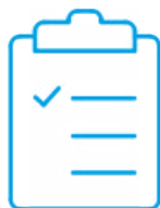
Calibration certificate with accreditation