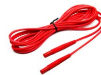
Test lead 5 / 10 / 20 m red 1 kV (banana plugs)