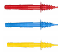
Pin probe 1 kV (banana socket) red / blue / yellow