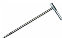
2x earth contact test probe (rod), 30 cm