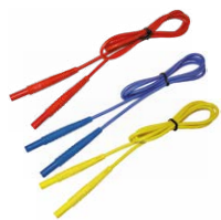
Test lead 1.2 m (banana plugs) red / blue / yellow