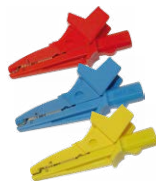
Crocodile clip 1 kV 20 A red / blue / yellow