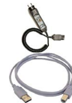
WS-03 adapter with START button with UNI-Schuko plug