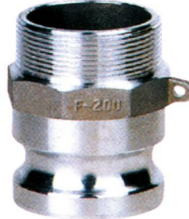
STAINLESS STEEL (SS316)