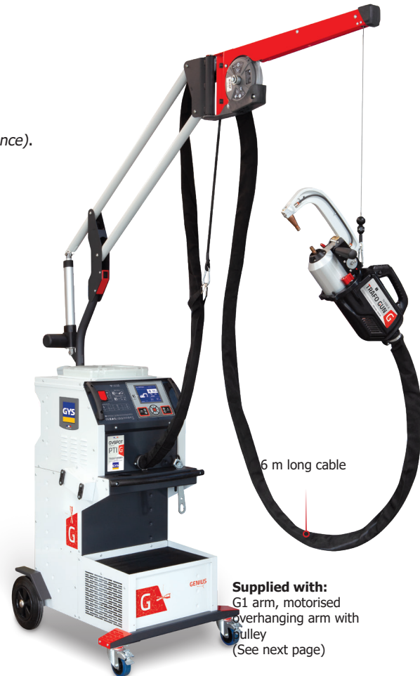
Supplied with: G1 arm, motorised overhanging arm with pulley (See next page)