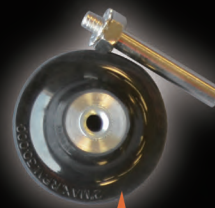
2" ROLL LOCK HOLDER