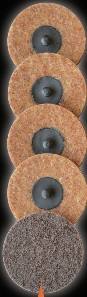
3" SURFACE PREP DISC - COURSE