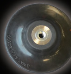
3" ROLL LOCK HOLDER