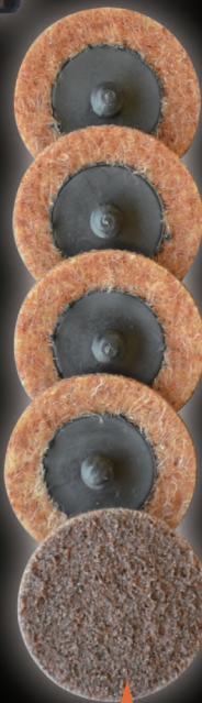
2" SURFACE PREP DISC - MEDIUM