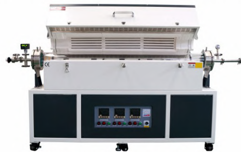
1200°C Three Zones Split Tube Furnace