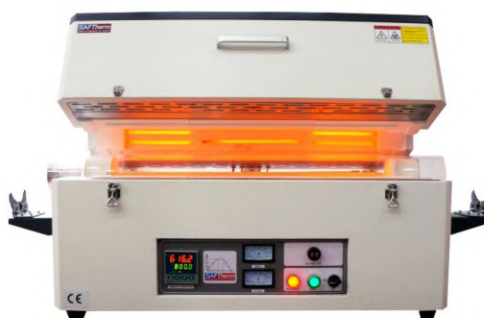
1200°C Split Tube Furnace