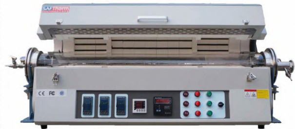
1200°C three zones split tube furnace