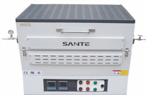
1400°C split tube furnace