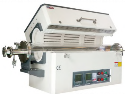
1200°C split tube furnace