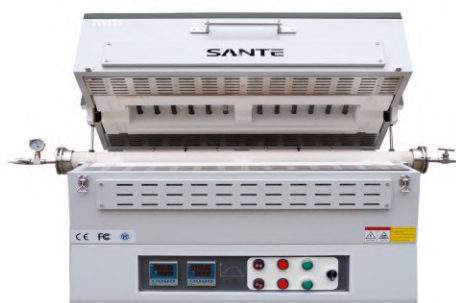
1400°C split tube furnace