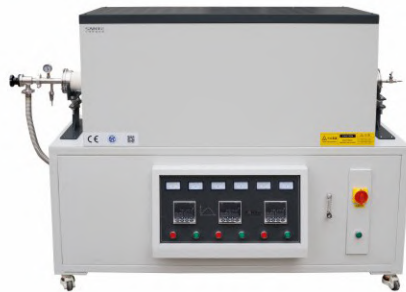
1700°C three zones Non-split tube furnace