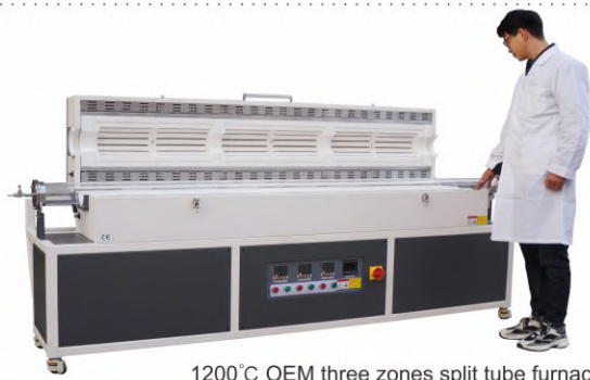
1200°C OEM three zones split tube furnace