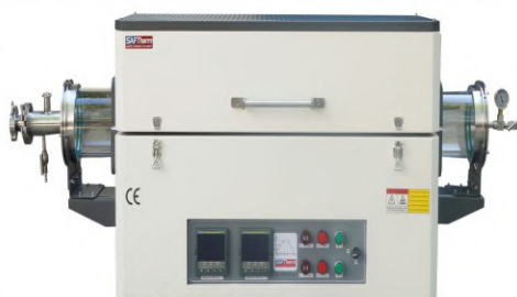
1200°C split tube furnace