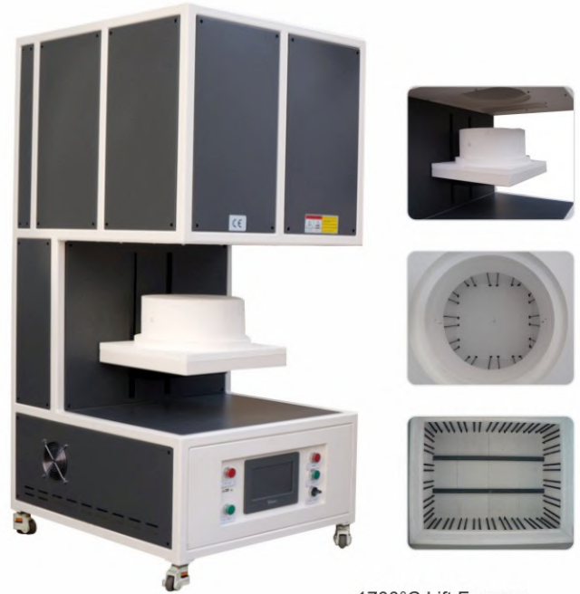
1700°C Lift Furnace