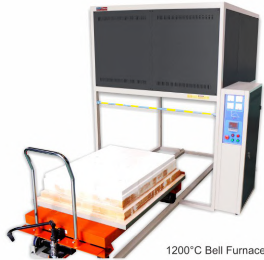
1200°C Bell Furnace

Electrical resistance bell furnace are more economic and less heat loss, more efficient and cost effective. Its bottom floor is available to load in all sides and smoothly moved to the correct position along the track by using the manual or automatic crane .The bottom floor rises into the furnace chamber and lifts the load into the heated zone The crane is strong enough to support the weight of the loaded bottom floor ,which will help operators do their job far more efficiently, cost-effectively and safely.