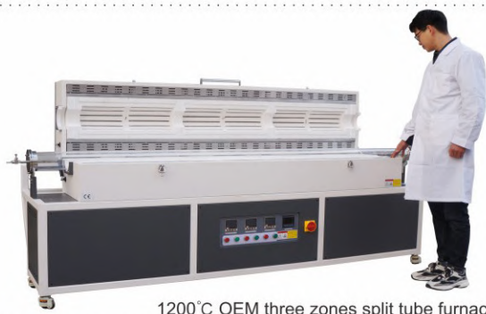
1200°C OEM three zones split tube furnace