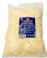
Cheswick Mozzarella Shredded 1kg