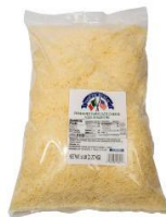
North Beach Fancy Parmesan Shredded 2.27kg