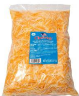
Ameritto Red Cheddar & Monterey Jack Shredded 1kg