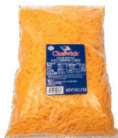
Cheswick Red Cheddar Shredded 1kg