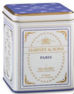
HARNEY & SONS HT TIN