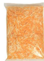
Ameritto 3cheeses Mexican Blend 1kg