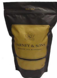
HARNEY & SONS LOOSE TEA