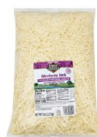
Ameritto Monterey Jack Shredded 1kg