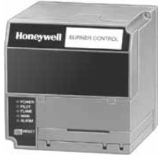
Dimensions in inches (millimeters)