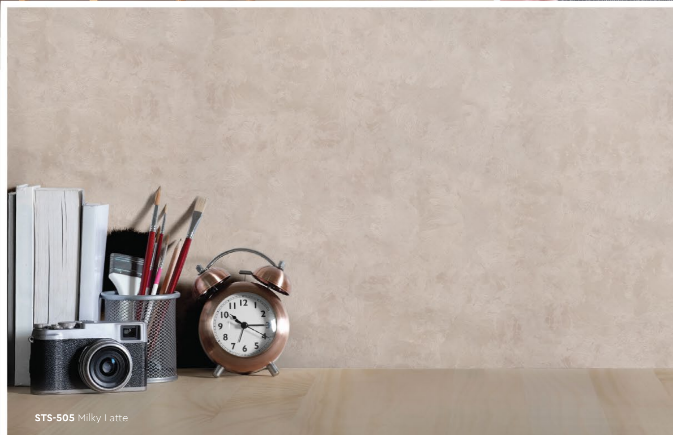
STS-505 Milky Latte

All color shown are as close to the actual Suzuka® Strato® colors as modern printing techniques permit, nonetheless, there are still color/tone differences.