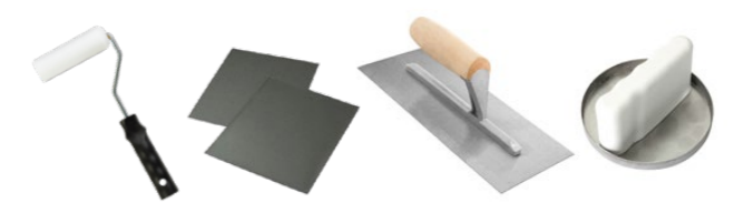
Tools: Roller, Sand Paper (600 Grit) Trowel & Piccolo Tool

IMPORTANT: Color may vary on application technique & amount of material used. Dilution Guide: Primer : Max 3% of clean water. Texture : Do not dilute.