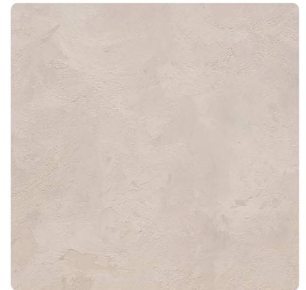
STS-505 Milky Latte