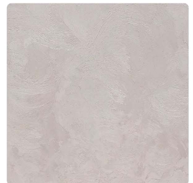
STS-506 Ash Blonde