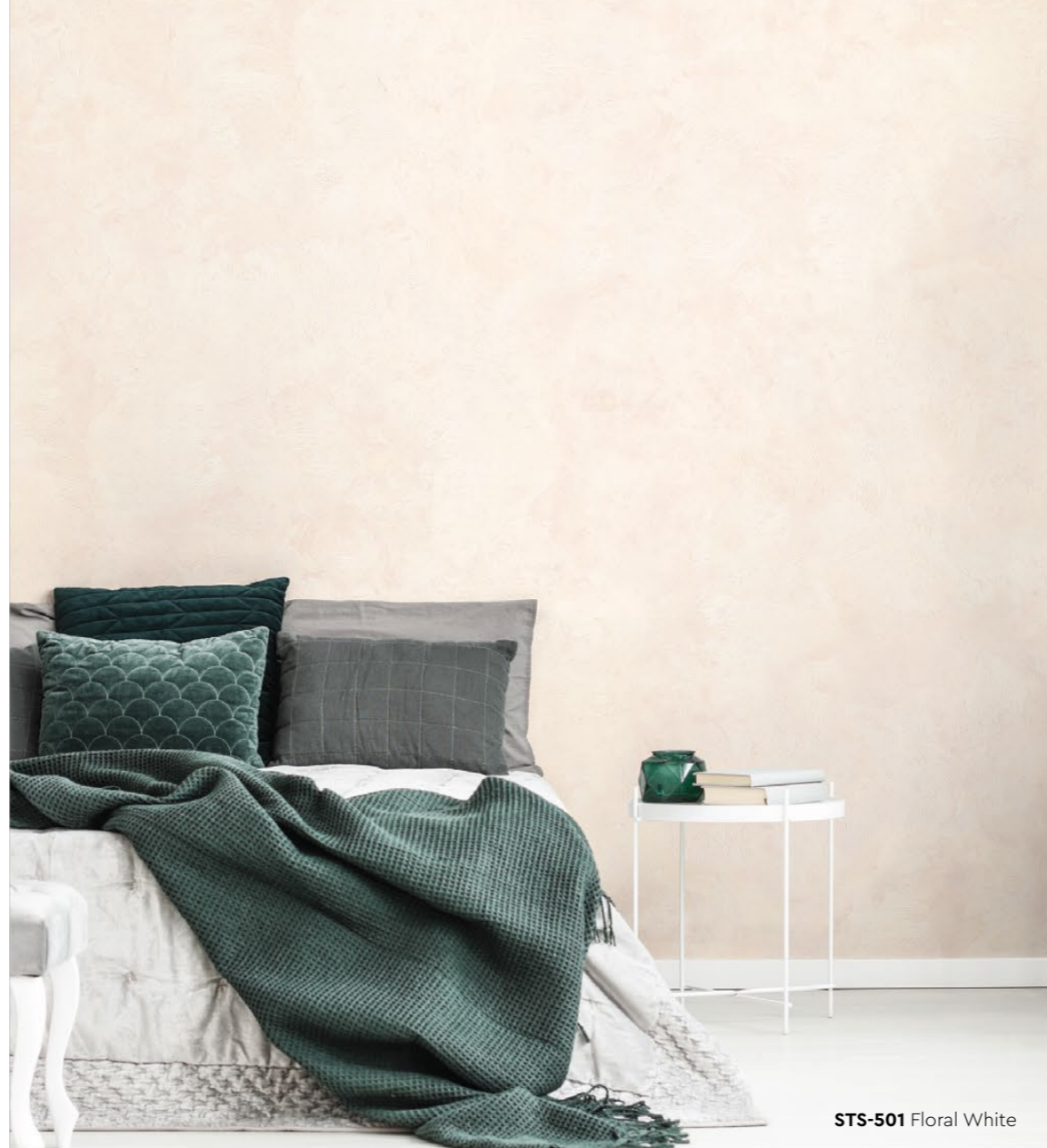
STS-501 Floral White