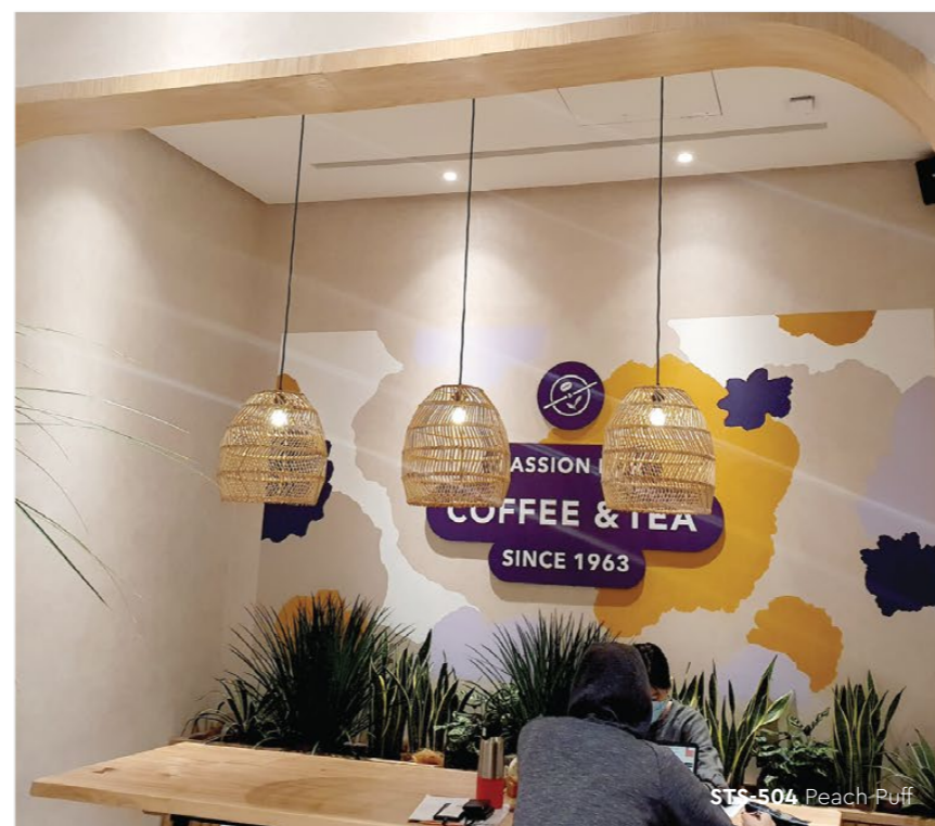
STS-504 Peach Puff

We highly recommend seeing actual samples before ordering.