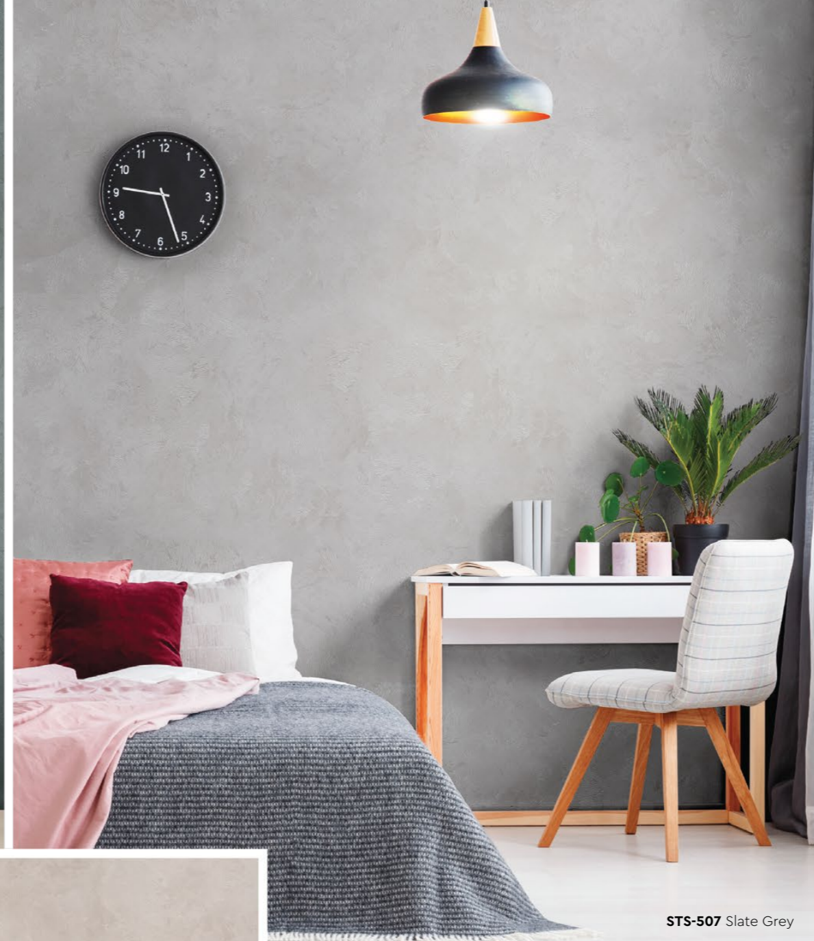
STS-507 Slate Grey