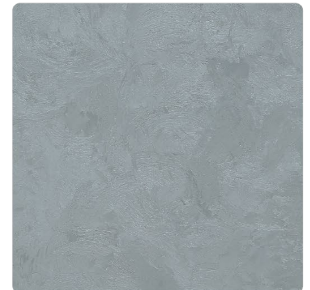
STS-508 Pale Green