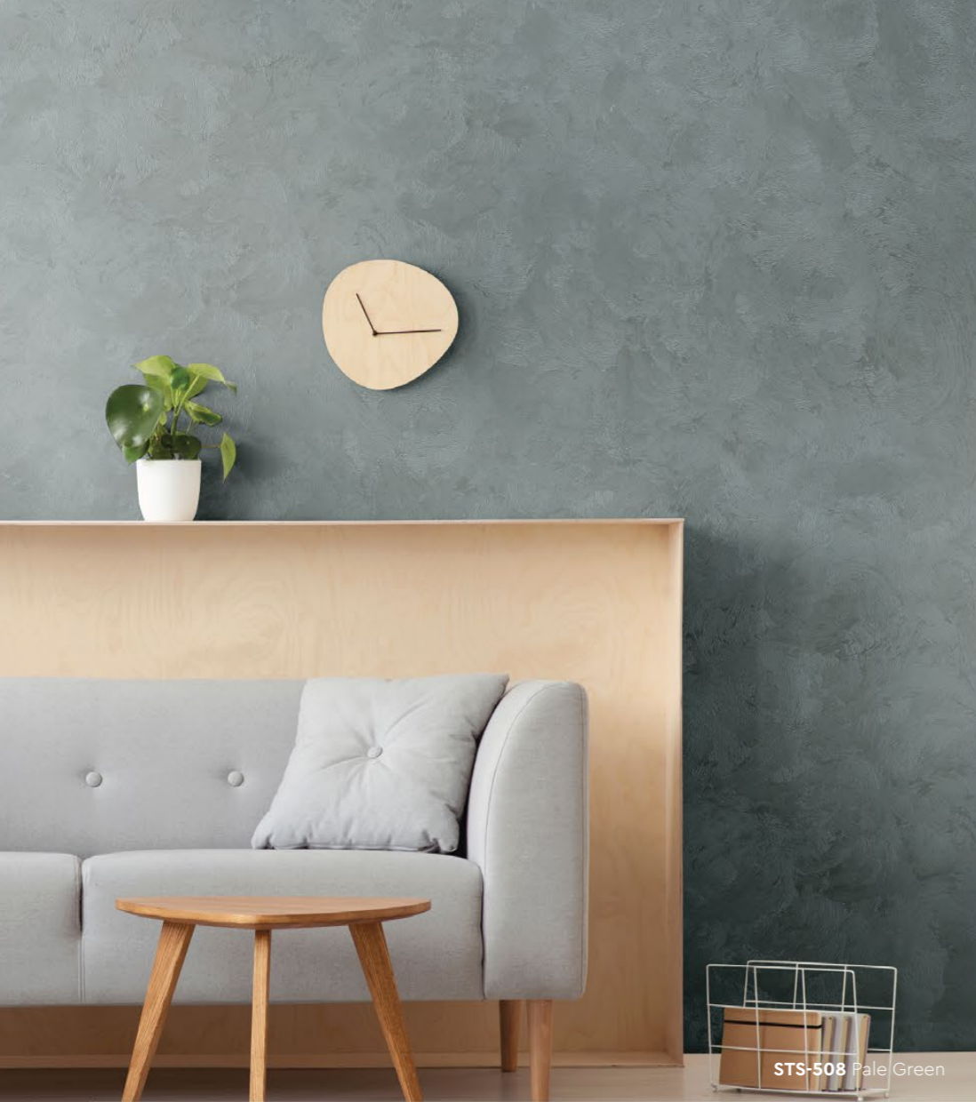
STS-508 Pale Green