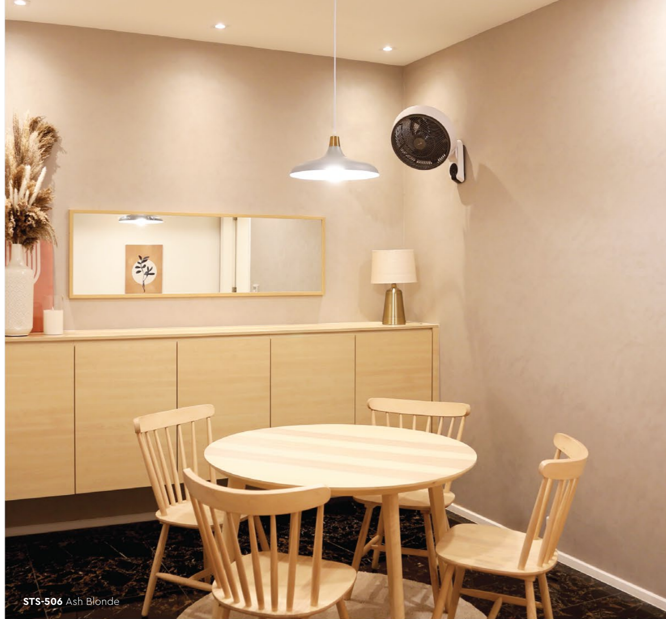
STS-506 Ash Blonde

All color shown are as close to the actual Suzuka® Strato® colors as modern printing techniques permit, nonetheless, there are still color/tone differences.