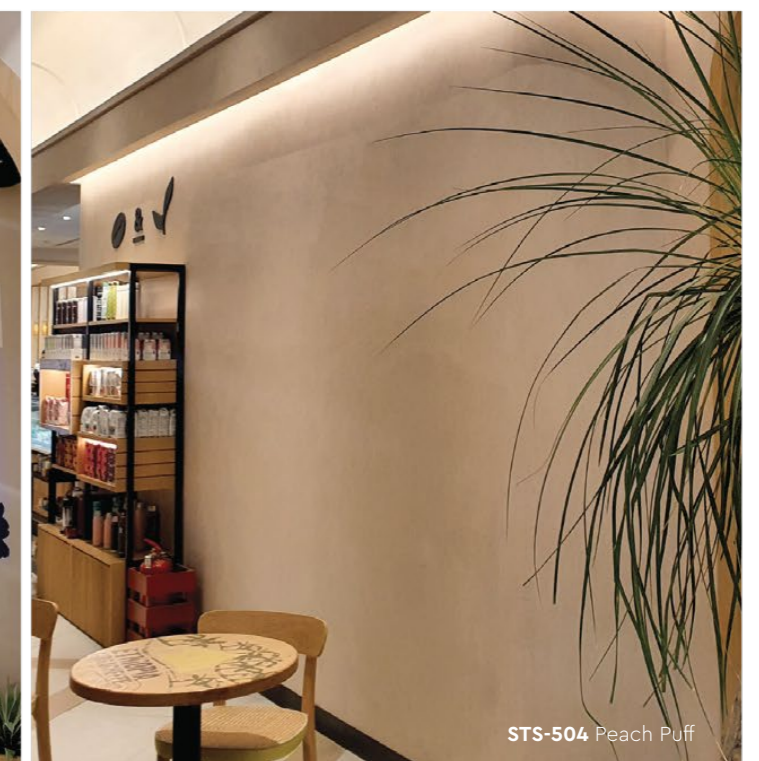
STS-504 Peach Puff