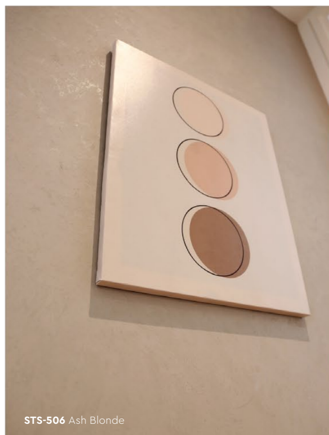
STS-506 Ash Blonde