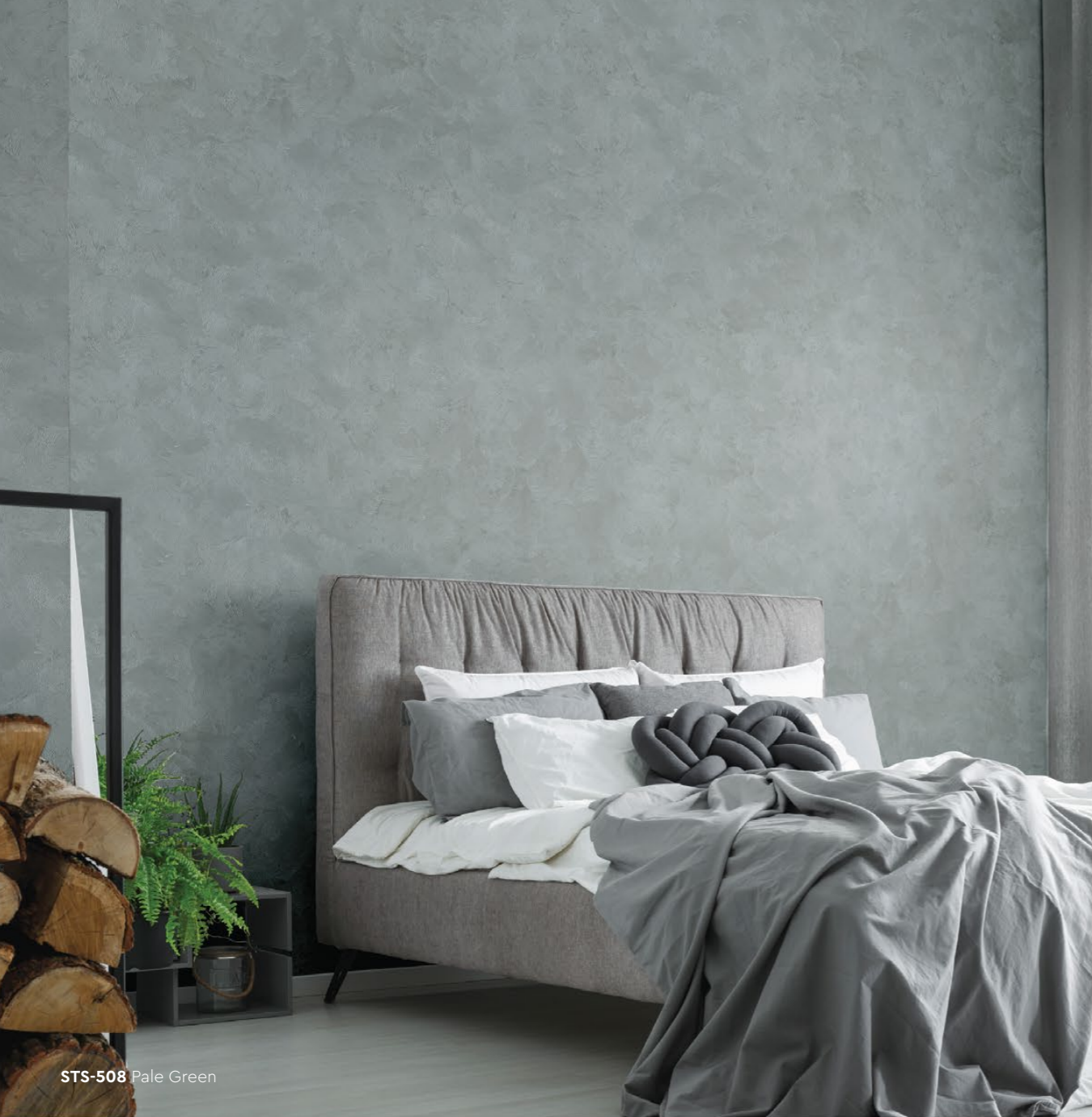
STS-508 Pale Green