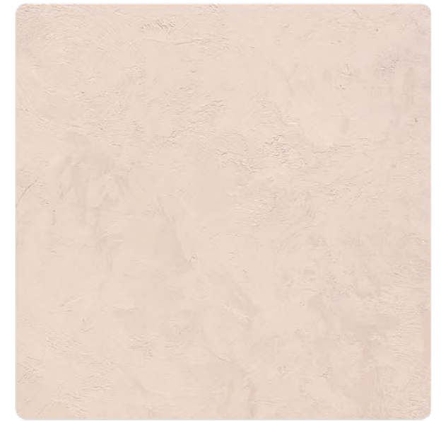
STS-504 Peach Puff

We highly recommend seeing actual samples before ordering.