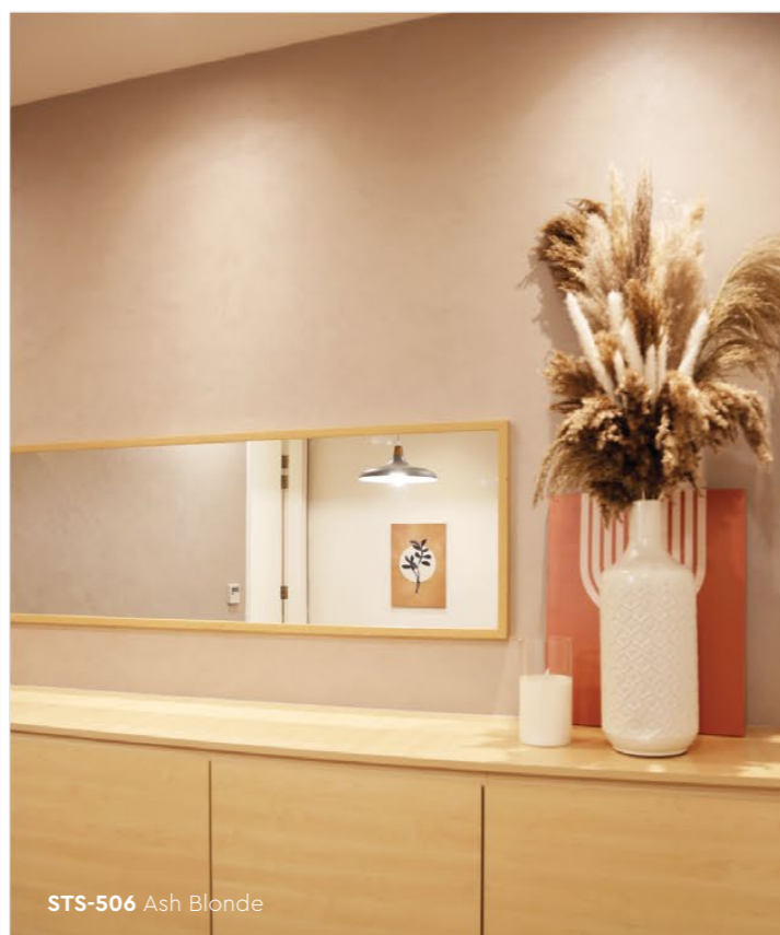
STS-506 Ash Blonde