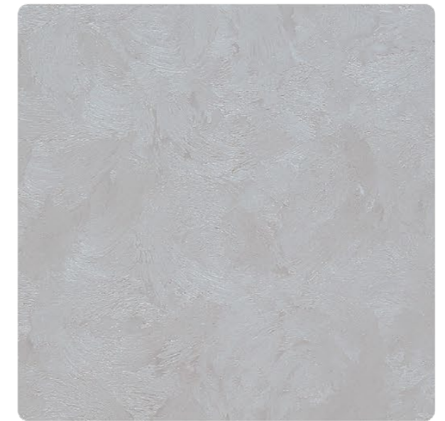
STS-507 Slate Grey