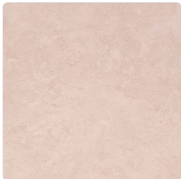
STS-503 Misty Rose