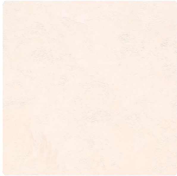
STS-501 Floral White