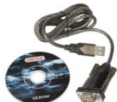
RS-232 serial transmission cable