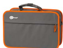
L2 carrying case