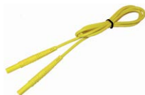
Test lead 5 / 10 / 20 m (banana plugs) yellow