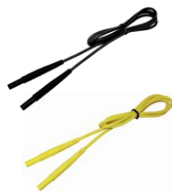
Test lead 1.2 m (banana plugs) black / yellow

U1 / I1 WAPRZ003DZBBU111 U2 / I2 WAPRZ003DZBBU212