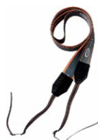
M1 hanging straps