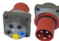
Three-phase socket adapter 63 A