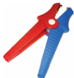
2x Kelvin clamp, 1 kV, 25 A