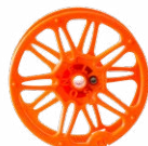
Test wire reel