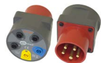
Three-phase socket adapter 16 A / 32 A