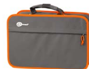
L1 carrying case