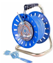
Test lead 75 / 100 / 200 m blue, for MRU (banana plugs, on a reel)

WAPRZ075REBBSZ WAPRZ100REBBSZ WAPRZ200REBBSZ