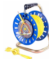
Test lead 75 / 100 / 200 m yellow, for MRU (banana plugs, on a reel)

WAPRZ075BUBBSZ WAPRZ100BUBBSZ WAPRZ200BUBBSZ