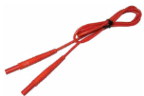
Test lead with banana plugs; 1 kV; 1.2 m; red