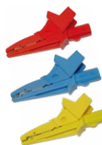
Crocodile clip, 1 kV 20 A red/blue/yellow