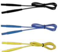
Test lead 1.2 m CAT III/1000V CAT IV/600V black/blue/yellow