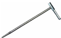
2x earth contact pin probe (30 cm)