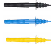
Pin probe CAT III/1000V CAT IV/600V black/blue/yellow