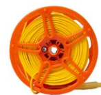
Earthing measurement test lead with banana plugs on reel; 50 m; yellow