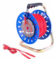
Test lead 75 / 100 / 200 m red, for MRU (banana plugs, on a reel)

WAPRZ075REBBSZ WAPRZ100REBBSZ WAPRZ200REBBSZ