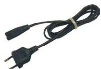
230 V power cord (IEC C7 plug)