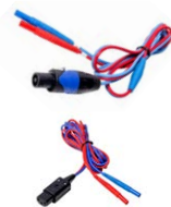
Double-wire test lead

1.5 m (PAT plug/banana plugs) WAPRZ1X5DZBB