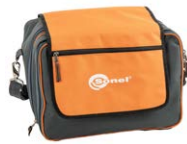
L-11 carrying case