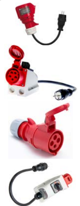
Three-phase socket adapter 16 A