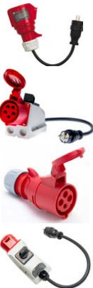
Three-phase socket adapter 32 A