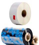
Accessories for SATO printer