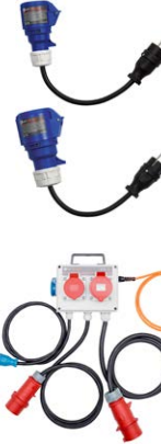
3P industrial socket adapter