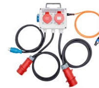
PAT-3F-PE adapter for leakage current measurement