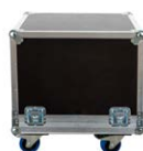
Transport case with wheels WAWALXXL2