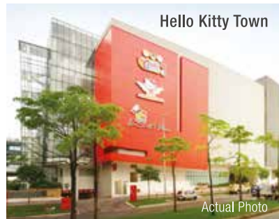
Hello Kitty Town