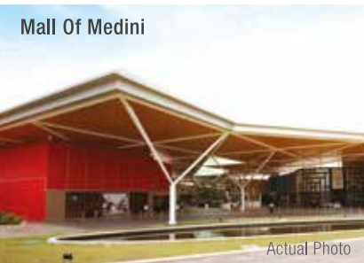
Mall Of Medini