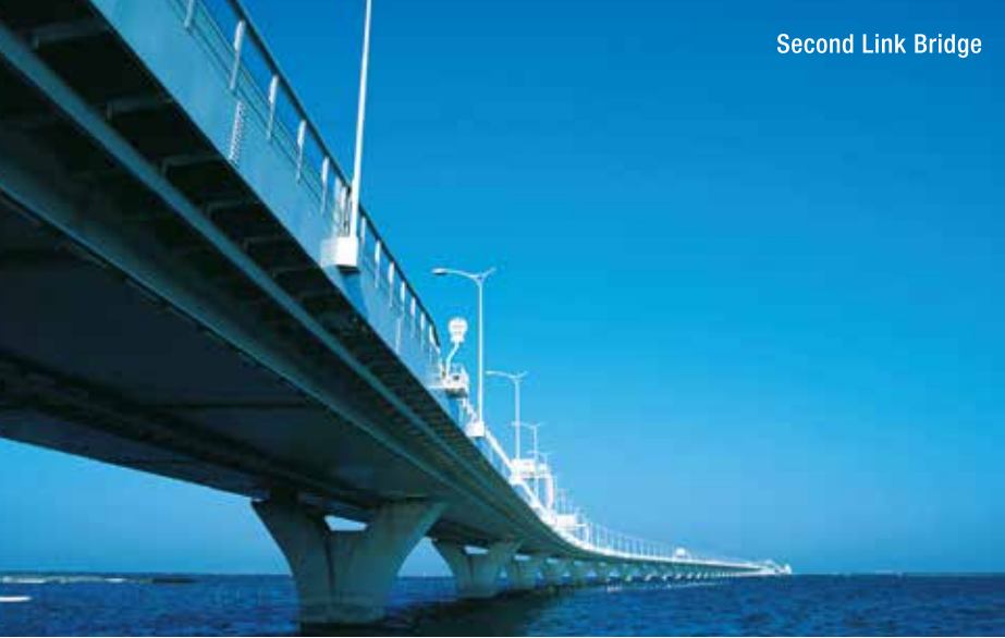
Second Link Bridge