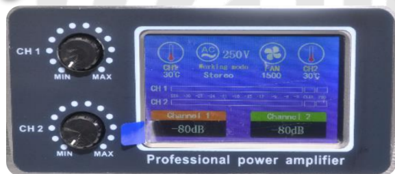
*Large Digital Display Screen