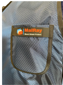
Big front pocket