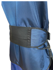
Elastic waist belt