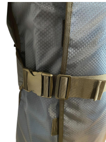
YKK large buckle