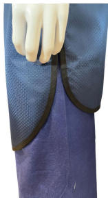
Side slits with velcro