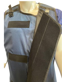
Front Velcro closure