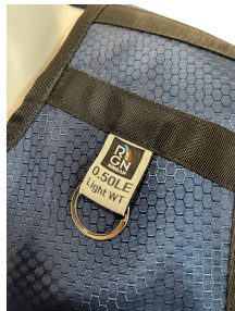
Label tag with ring