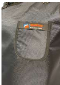
Big front pocket