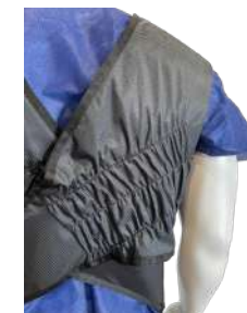
Criss-cross elastic back