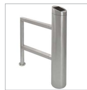
SWB_RL railing with built-in IR sensor