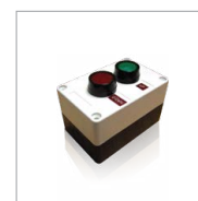
Push Button Manual Push Button