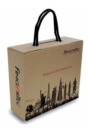
Packaging Dimension (mm) : 245 (L) x 90 (W) x 225 (H) Weight : 1kg