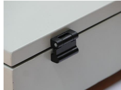
Heavy Duty Metal Latch