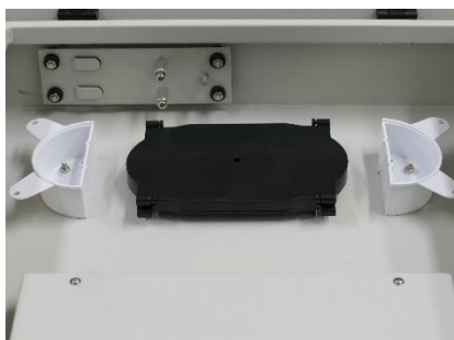
Fiber Spicing Tray