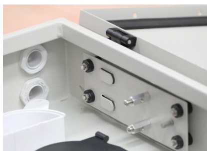
2 Main Incoming Fiber