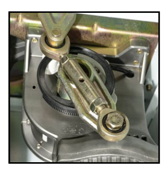
CONTROL Combination of automatic and manual opening for easy function.

The Ranger Pro Series barrier can be used to manage and maintain several entry points at the same time, both locally and remotely, ensuring the full functionality of accesses in every type of location such as car parks, shopping centres, resident, hotel, hospitals, airports and railway station as well as all others type of small or large public facility.