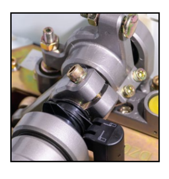
RELIABILITY The integration both core and machine ensures smooth and proper operation of the barrier.