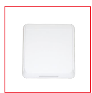
Long Range Reader