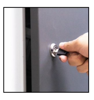
PRACTICAL The manual release is easy, intuitive and protected by a personal key.