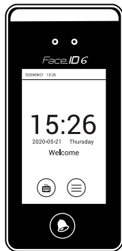
Face ID 6